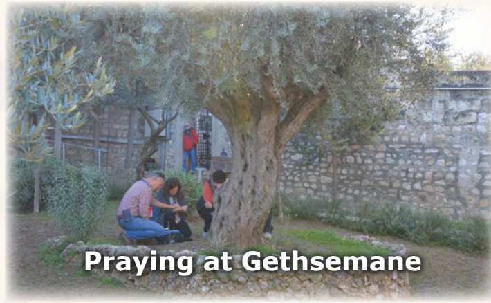
Praying at Gethsemane

After an excellent breakfast buffet we will travel to the mountain fortress of Masada, truly a remarkable piece of history. We'll ascend by cable car to visit the magnificent ruins of the fortress where the Jewish zealots made the last stand of the Judean revolt against Rome. Today the remains of Herod's buildings, palaces, storehouses, cisterns, and a 6th Century Byzantine church are still in view. We will then drive along the shores of the Dead Sea to Ein Gedi, a green oasis in the middle of the desert, and see the area where David hid while fleeing from King Saul. Afterwards we will travel to Qumran to see the caves where they hid some of the Dead Sea Scrolls. After lunch we will begin our ascent to Jerusalem. On the way, we will stop to view the St. George Monastery, an active monastery since the 5th century. We will also get a glimpse of "the Valley of the Shadow of Death." We arrive in Jerusalem, the capital of Israel for over 3000 years, and pause on Mount Scopus where our guide will lead us in the traditional Jewish Welcome. Dinner and overnight will be at our hotel in Jerusalem. (B/L/D)