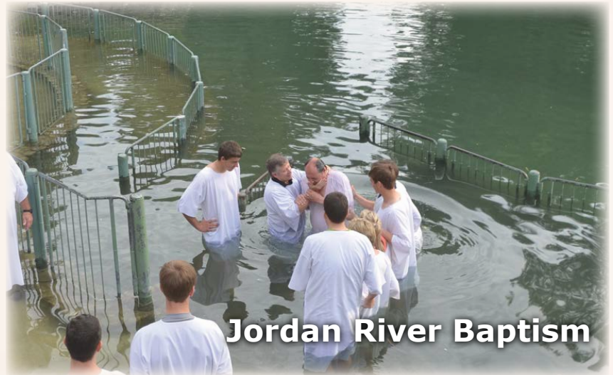
Jordan River Baptism

After breakfast we take a boat ride across the Sea of Galilee. While on the boat we'll pause for a brief worship service and remember the many miracles our Lord performed in this area. We'll dock at Nof Ginossar to visit the "Jesus Boat" museum to see a boat that dates back to the time of Jesus. Then we will stop at the Primacy of Peter where Jesus commanded Peter to "Feed my sheep." We'll proceed to Capernaum