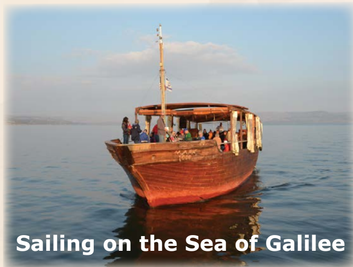
Sailing on the Sea of Galilee

After breakfast, we will travel up the coast to Caesarea by the sea. There we will visit the Crusaders' castle, the Roman amphitheater, the seaport from which the Apostle Paul sailed to Rome, and the Roman aqueduct system. We continue along the coast to Mount Carmel to see the site of Elijah's triumph over the prophets of Baal. After lunch we will travel to Nazareth, the boyhood home of Jesus, to visit the oldest of the churches of the annunciation and Mary's well. Here we will also visit The Precipice, where they wanted to throw Jesus off the "brow" and kill Him. The Precipice also gives a great view of the "Valley of Armageddon." On our way to Tiberias we will stop in the little town of Cana where Christ turned the water into wine. We will hold a short ceremony in an ancient church for the couples who wish to renew their marriage vows. Then we'll proceed to our hotel in Tiberias on the Sea of Galilee for dinner and overnight. (B/L/D)