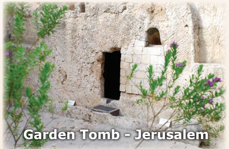
Garden Tomb - Jerusalem

Today our memorable journey and Holy Land pilgrimage comes to an end. We will transfer to the airport in Tel Aviv and board the plane for our return flight home. In flight we can fellowship with our friends and remember the many things we shared together.