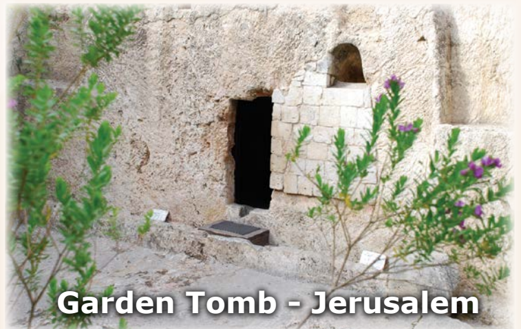
Garden Tomb - Jerusalem

Today our memorable journey and Holy Land pilgrimage comes to an end. We will transfer to the airport in Tel Aviv and board the plane for our return flight home. In flight we can fellowship with our friends and remember the many things we shared together.