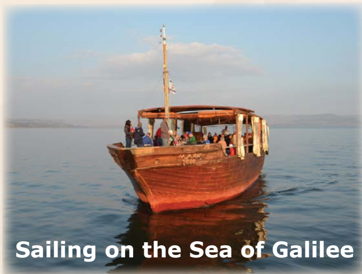
Sailing on the Sea of Galilee

This morning we will leave the Galilee area travel south through the Jordan River Valley. We will stop and visit the new excavations at Beit She'an, the city where the Philistines hung the bodies of Saul and Jonathan. Then we will visit Bethabara where John baptized those who came to him (John 1:28). This is also known as the "place of crossing" where the children of Israel crossed into the Promised Land (Joshua 3:14-17). We will travel through the Jordan Valley to Jericho, one of the oldest cities in the world. If conditions permit, we will enter Jericho to see the excavations of the ancient walls, view the Mount of Temptation, and see Elisha's Spring. Our hotel tonight is located just off the shores of the Dead Sea. The Dead Sea is 1300 feet below sea level and is the lowest spot on the earth. Be sure you take time to swim in the Dead Sea or the freshwater pool and spa. The waters are made up of 25% salt and are so dense