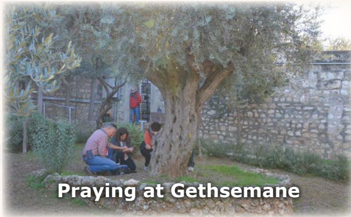
Praying at Gethsemane

This morning we will begin our tour with a visit to the Temple Mount where the Jewish temple stood until its destruction by the Roman Legions in 70 A.D. There we will see the Dome of the Rock Mosque built over the rock where Abraham prepared to sacrifice Isaac, the Al-Aqsa Mosque, and the Golden Gate. We'll continue our walk through the Old City to the beautiful Crusader Church dedicated to St. Anne and the nearby Pool of Bethesda. Then we travel a short distance to the Mount of Olives for a breathtaking view of the city of Jerusalem. While we are here, our guide will point out all of the important sites of Jerusalem. We will proceed to Mount Zion to visit the Upper Room, traditional site of the Last Supper and the fire of the Holy Spirit on