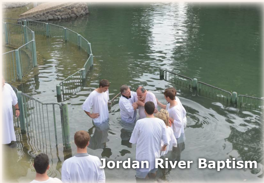
Jordan River Baptism

After breakfast we take a boat ride across the Sea of Galilee. While on the boat we'll pause for a brief worship service and remember the many miracles our Lord performed in this area. We'll dock at Nof Ginossar to visit the "Jesus Boat" museum to see a boat that dates back to the time of Jesus. Then we will stop at