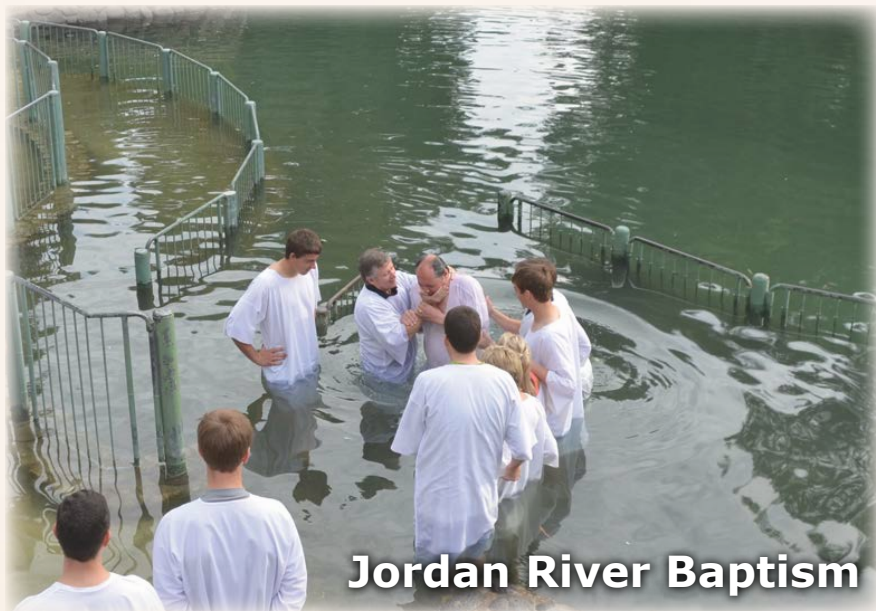
Jordan River Baptism

After breakfast we take a boat ride across the Sea of Galilee. While on the boat we'll pause for a brief worship service and remember the many miracles our Lord performed in this area. We'll dock at Nof Ginossar to visit the "Jesus Boat" museum to see a boat that dates back to the time of Jesus. Then we will stop at the Primacy of Peter where Jesus commanded Peter to "Feed my sheep." Nearby we'll enter Capernaum