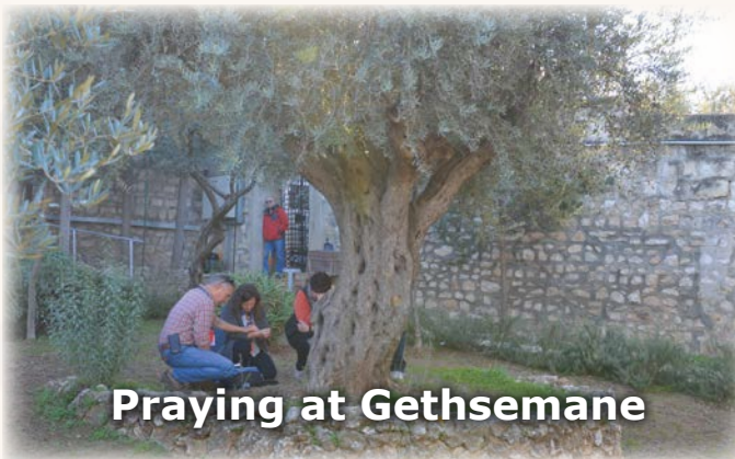
Praying at Gethsemane

This morning we start the day with a visit to the Temple Mount where the Jewish temple stood until its destruction by the Roman Legions in 70 A.D. There we'll pass the Dome of the Rock Mosque built over the rock where Abraham prepared to sacrifice Isaac, the Al-Aqsa Mosque, and the Golden Gate. We'll continue our walk into the Old City to the beautiful Crusader Church dedicated to St. Anne and the nearby Pool of Bethesda. Next, we will visit the famous Western Wall and Tunnel Excavation site. We will then walk through the old colorful oriental market and visit the restored Jewish Quarter and the Roman Cardo, the main street of Jerusalem during Roman times. Along the way we will pass many of the traditional Stations of the Cross on the Via Dolorosa. Then we'll proceed to Mount Zion to visit the traditional location of the Upper Room, site of