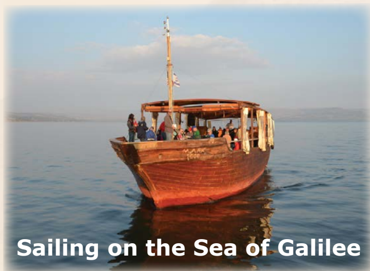
Sailing on the Sea of Galilee

After breakfast, we begin our tour of the Holy Land. We start with a visit to Joppa, Jonah's port of embarkation for Tarshish. Joppa was also the home of Tabitha (or Dorcas) who was raised from the dead by Peter. It was also here that Peter learned that God was interested in the salvation of the Gentiles. We will then travel up the coast to Caesarea by the sea. There we will visit the Crusaders' castle, the Roman amphitheater, the seaport from which the Apostle Paul sailed to Rome, and the Roman aqueduct system. We continue along the coast to Mount Carmel to see the site of Elijah's triumph over the prophets of Baal. After lunch we will travel to Nazareth, the boyhood home of Jesus, to visit the oldest of the churches of the annunciation and Mary's well. Here we will also visit The Precipice, where they wanted to throw Jesus off the "brow" and kill Him. The Precipice also gives a great view of the "Valley of Armageddon." On our way to Tiberias we will stop in the little town of Cana where Christ turned the water into wine. We will hold a short ceremony in an ancient church for the couples who wish to renew their marriage vows. Then we'll proceed to our hotel in Tiberias on the Sea of Galilee for dinner and overnight. (B/L/D)