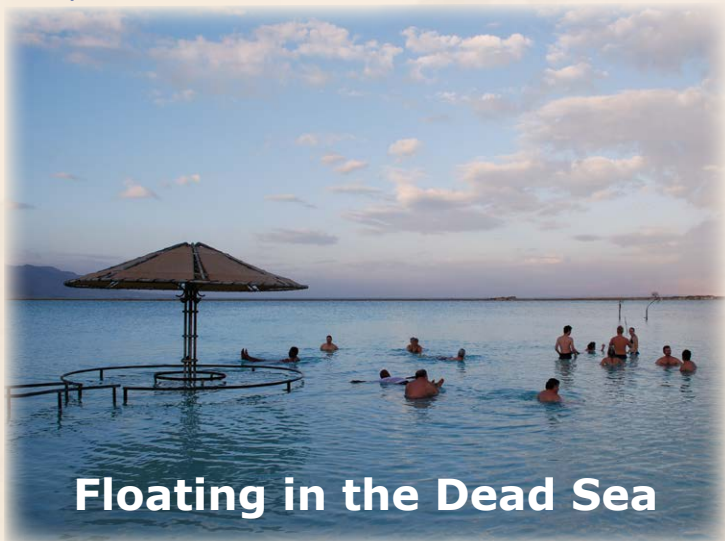
Floating in the Dead Sea

After breakfast at our hotel we will head northeast to Tel Dan, the ancient city where Abraham traveled to rescue his nephew Lot (Genesis 14:14). Then we will drive to the site of Caesarea Philippi (Baniyas) where springs form a source of the Jordan River. Near here Peter made his great confession that Jesus Christ was Lord! From several vantage points today we can see Mount Herman in the distance.