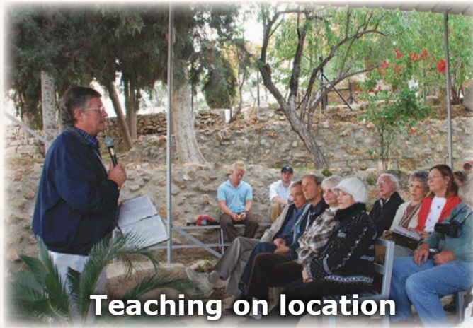
Teaching on location

This morning we will start on the Mount of Olives for a breathtaking view of the city of Jerusalem. While we are here, our guide will point out all of the important sites of Jerusalem. We will then proceed to the City of David, where we will visit the recent archaeological discovery of the Pool of Siloam through Hezekiah's Tunnel.