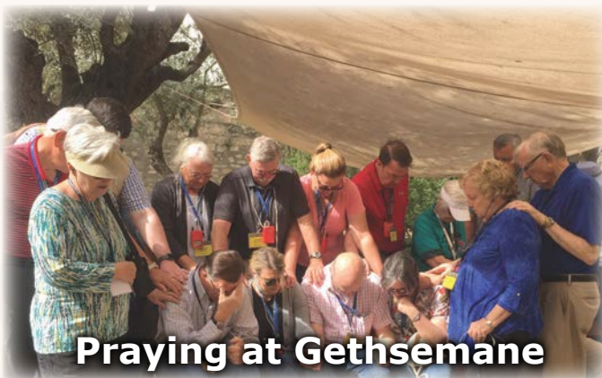
Praying at Gethsemane

This morning we will begin our tour with a visit to the Temple Mount where the Jewish temple stood until its destruction by the Roman Legions in 70 A.D. There we will see the Dome of the Rock Mosque built over the rock where Abraham prepared to sacrifice Isaac. It is also the location of the Al-Aqsa Mosque and the Golden Gate. We'll continue our walk through the Old City to the beautiful Crusader Church dedicated to St. Anne, where we will enjoy the amazing acoustics. We will also see the nearby Pool of Bethesda. We will visit Ecce Homo (Behold the Man), site of the Antonia Fortress and Pilate's Palace. We'll pass many of the traditional 14 Stations of the Cross on the Via Dolorosa and also see part of the old colorful oriental market. We will continue our walk and visit the restored Jewish Quarter and the Roman Cardo, the main street of Jerusalem in Roman times. We will also be visiting the Western Wall and Tunnel Excavation site and the Southern Wall excavation