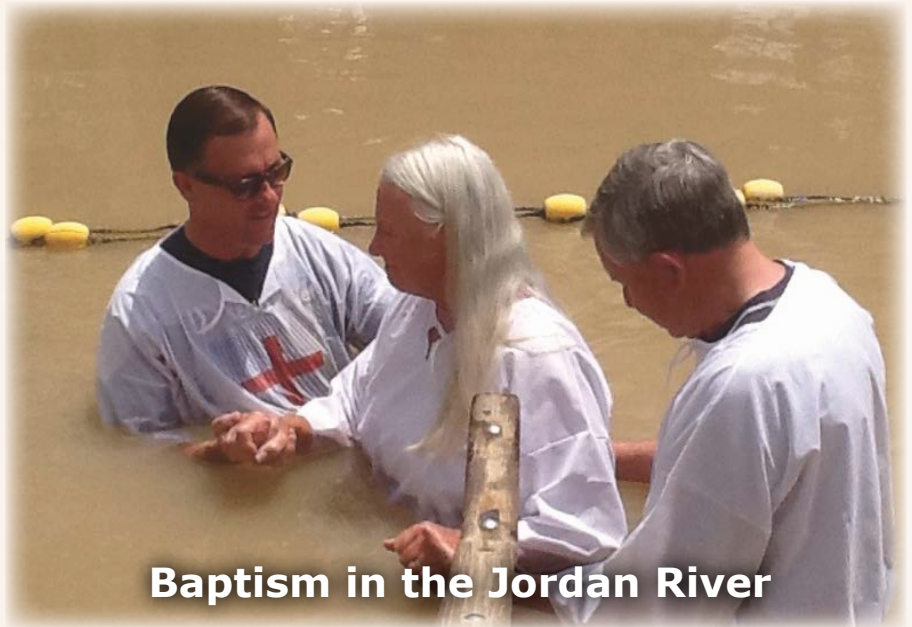
Baptism in the Jordan River

After breakfast we take a boat ride across the Sea of Galilee. While on the boat we'll pause for a brief worship service and remember the many miracles our Lord performed in this area. We'll dock at Nof Ginossar to visit