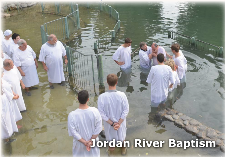
Jordan River Baptism

After breakfast we take a boat ride across the Sea of Galilee. While on the boat we'll pause for a brief worship service and remember the many miracles our Lord performed in this area. We'll dock at Nof Ginossar to visit the "Jesus Boat" museum to see a boat that dates back to the time of Jesus. Next we'll gather on the Mount of Beatitudes by the Sea of Galilee to read the Sermon