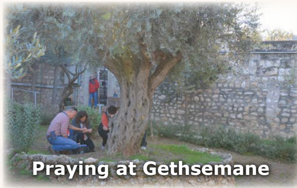
Praying at Gethsemane

After breakfast we will re-enter the Old City of Jerusalem for another walking tour. Our first stop is the Western Wall (Wailing Wall) and Tunnel excavation site.