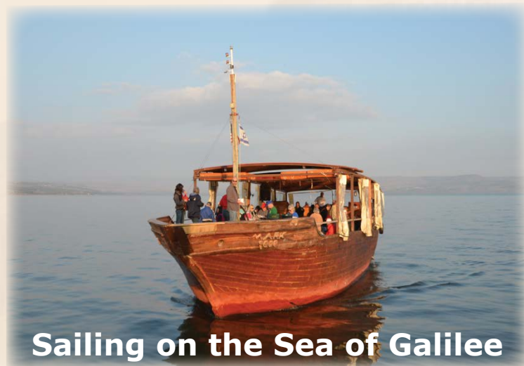
Sailing on the Sea of Galilee

After breakfast, we will travel up the coast to Caesarea by the Sea. There we will visit the Crusaders' castle, the Roman amphitheater, the seaport from which the Apostle Paul sailed to Rome, and the Roman aqueduct system. We continue along the coast to Mount Carmel to see the site of Elijah's triumph over the prophets of Baal. After lunch we continue north to Megiddo on the Plain of Armageddon to see King Solomon's stables and water supply system. Prophecy will come alive at Megiddo as we look over the Valley of Armageddon. We then travel to Nazareth, the boyhood home of Jesus, to visit the oldest of the churches of the annunciation and Mary's well. On our way to Tiberias we will stop in the little town of Cana where Christ turned the water into wine. We will hold a short ceremony in an ancient church for the couples who wish to renew their marriage vows. Then we'll proceed to our hotel in Tiberias on the Sea of Galilee for dinner and overnight. (B/L/D)