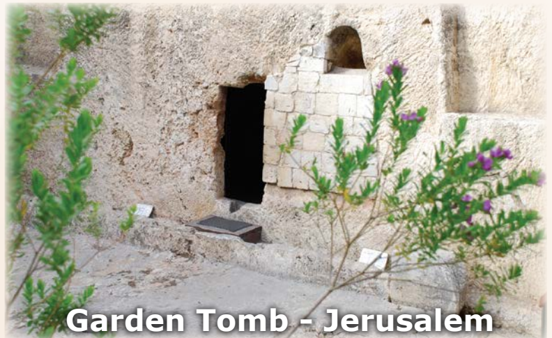
Garden Tomb - Jerusalem

Today our memorable journey comes to an end as we transfer to the airport in Tel Aviv and board the plane for our return flight home. In flight we can fellowship with our friends and remember the many things we shared together.