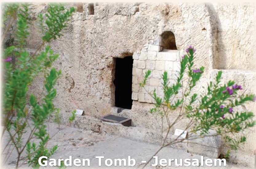
Garden Tomb - Jerusalem

Today our memorable journey comes to an end as we transfer to the airport in Tel Aviv for our return flight home. In flight we can fellowship with our friends and remember the many things we shared together.