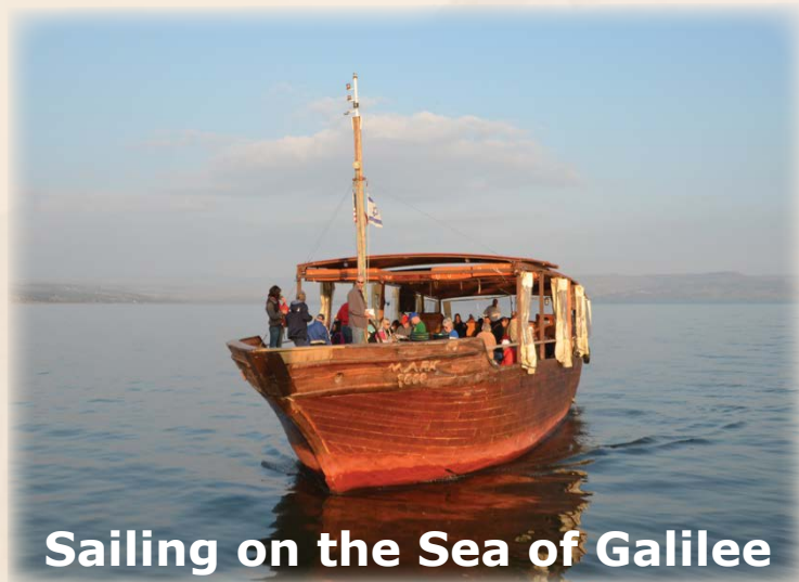
Sailing on the Sea of Galilee

This morning we will begin to leave the region of Galilee. Our first stop is Nazareth, the boyhood home of Jesus, where we find the oldest of the churches of the annunciation. We then proceed to Mount Carmel to see the site of Elijah's triumph over the prophets of Baal. After this we will head south to Bethlehem to visit the Church of the Nativity, built over the cave of Christ's birth, as well as the Shepherd's Field and plains of Boaz. We will also see the ancient crafts of Bethlehem, dating from Crusader times, and visit one of the famous Bethlehem gift shops. We then travel to Jerusalem, the capital of Israel for over 3000 years, and pause on Mount Scopus where our guide will lead us in the traditional Jewish Welcome. Dinner and overnight will be at our hotel in Jerusalem. (B/L/D)