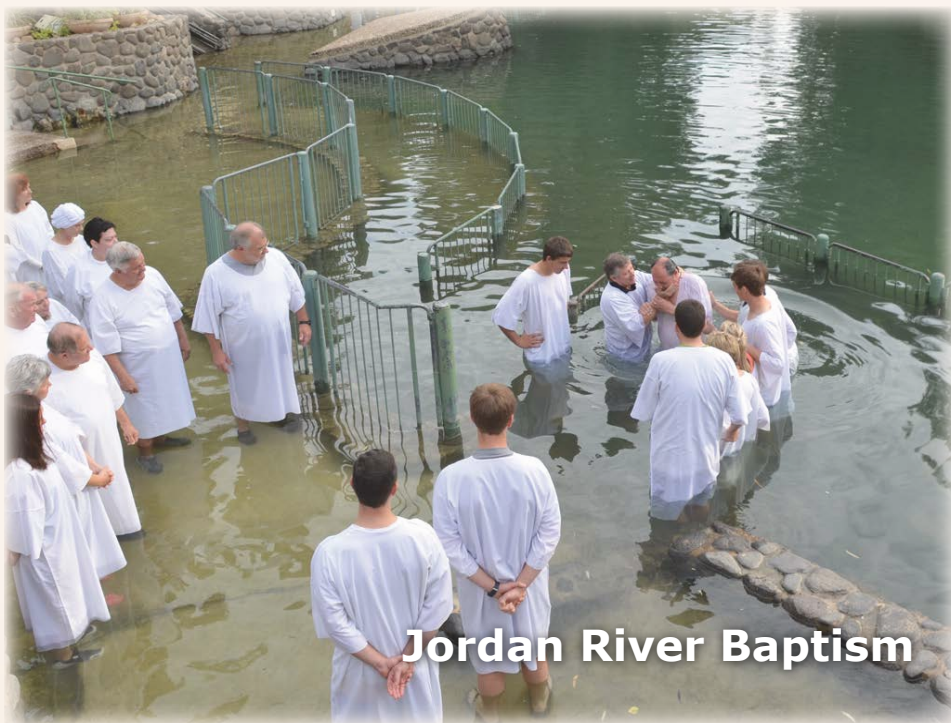
Jordan River Baptism

After breakfast we take a boat ride across the Sea of Galilee. While on the boat we'll pause for a brief worship service and remember the many miracles our