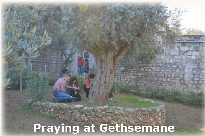
Praying at Gethsemane

We will begin our day by visiting Ein Gedi, a green oasis in the middle of the desert, seeing the area where David hid while fleeing from King Saul. Afterwards we will travel to Qumran to see the caves where the Dead Sea Scrolls were found. Next we'll stop at Bethabara, where John baptized those who came to him (John 1:28). This is also known as the "place of crossing" and is near the area where the children of Israel crossed into the Promised Land (Joshua 3:14-17). After this we proceed to Jericho, one of the oldest cities in the world. If conditions permit, we will enter Jericho to see the excavations of the ancient walls, view the Mount of Temptation, and see Elisha's Spring. This afternoon we will spend time on the shores of the Dead Sea, which is 1300 feet below sea level and is the lowest spot on the earth. Be sure you take time to swim in the Dead Sea. The waters are made up of 25% salt and are so dense that it's impossible to sink. You can literally sit up in the water as if you were in a chair. We will then return to our hotel for dinner and overnight. (B/L/D)