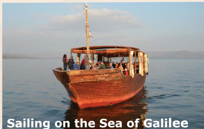
Sailing on the Sea of Galilee

After lunch we continue north to Megiddo on the Plain of Armageddon to see King Solomon's stables and water supply system. Prophecy will come alive at Megiddo as we look over the Valley of Armageddon. We then travel to Nazareth, the boyhood home of Jesus, to visit and tour 'Nazareth Village' and experience life as it was 2,000 years ago. We will also visit The Precipice, where they wanted to throw Jesus off the "brow" and kill Him. On our way to Tiberias we will stop in the little town of Cana where Christ turned the water into wine. Then we'll proceed to our hotel in Tiberias on the Sea of Galilee for dinner and overnight. (B/L/D)