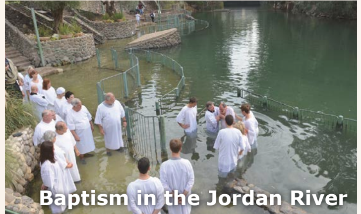
Baptism in the Jordan River

After breakfast we take a boat ride across the Sea of Galilee. While on the boat we'll pause for a brief worship service and remember the many miracles our Lord performed in this area. We'll dock at Nof Ginossar to visit the "Jesus Boat" museum to see a boat that dates back to the time of Jesus. Then we will stop at the Primacy of Peter where Jesus commanded Peter to "Feed my sheep." Then we'll proceed to Capernaum to see the remains of an early church, the ruins of Peter's house, and the