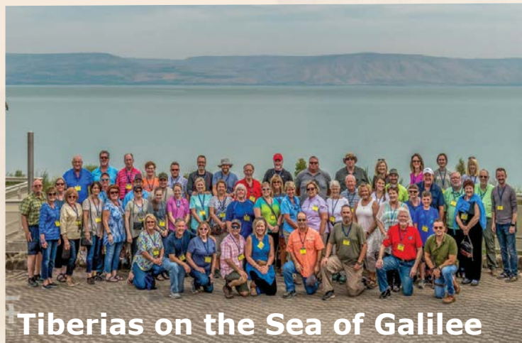
Tiberias on the Sea of Galilee

After breakfast, we will travel up the coast to Caesarea by the sea. There we will visit the Crusaders' castle, the Roman amphitheater, the seaport from which the Apostle Paul sailed to Rome, and the Roman aqueduct system. We continue along the coast to Mount Carmel to see the site of Elijah's triumph over the prophets of Baal. After lunch we continue north to Megiddo on the Plain of Armageddon to see King Solomon's stables and water supply system. Prophecy will come alive at Megiddo as we look over the Valley of Armageddon. We then travel to Nazareth, the boyhood home of Jesus, to visit the oldest of the churches of the annunciation and Mary's well. On our way to Tiberias we will stop in the little town of Cana where Christ turned the water into wine. We will hold a short ceremony in an ancient church for the couples who wish to renew their marriage vows. Then we'll proceed to our hotel in Tiberias on the Sea of Galilee for dinner and overnight. (B/L/D)