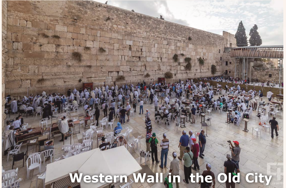
Western Wall in the Old City

After breakfast we take a boat ride across the Sea of Galilee. While on the boat we'll pause for a brief worship service and remember the many miracles our Lord performed in this area. We'll dock at Nof Ginossar to visit the "Jesus Boat" museum to see a boat that dates back to the time of Jesus. Then we will stop at