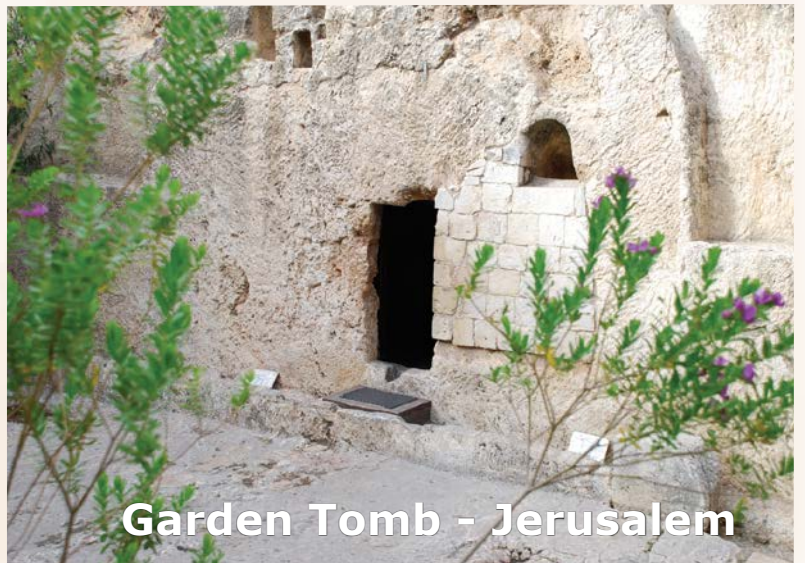
Garden Tomb - Jerusalem

Today, our memorable journey and Holy Land pilgrimage comes to an end. We will transfer to the airport in Tel Aviv and board the plane for our return flight home. In flight we can fellowship with our friends and remember the many things we shared together.