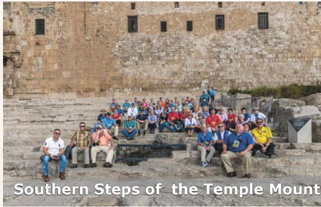
Southern Steps of the Temple Mount

Our second day in Jerusalem begins with a visit to the famous Western Wall and Tunnel excavation site. We will visit Ecce Homo (Behold the Man), site of the Antonia Fortress. We'll pass many of the traditional 14 Stations of the Cross on the Via Dolorosa and also see part of the old colorful oriental market. We will continue our walk and visit the restored Jewish Quarter and the Roman Cardo, the main street of Jerusalem in Roman times. Then we travel a short distance to the Mount of Olives for a breathtaking view of the city