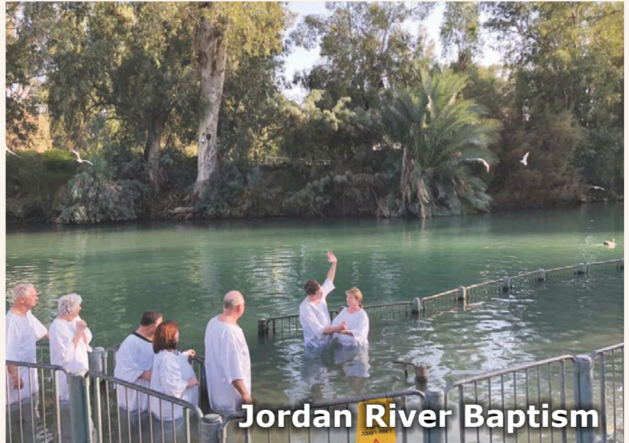
Jordan River Baptism

After breakfast we take a boat ride across the Sea of Galilee. While on the boat we'll pause for a brief worship service and remember the many miracles our Lord performed in