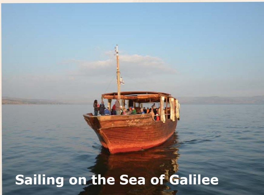
Sailing on the Sea of Galilee

This morning we will leave the Galilee area and travel south through the Jordan River Valley. We will explore the vast excavations at Beit She'an, the city where the Philistines hung the bodies of Saul and Jonathan. If conditions permit, we will enter Jericho to see the excavations of the ancient walls, view the Mount of Temptation, and see Elisha's Spring. After lunch in Jericho, we will travel to Qumran to see the caves where the Dead Sea Scrolls were found. On the way, we will stop at Bethabara where John baptized those who came to him (John 1:28). This is also known as the "place of crossing" and is near the area where the children of Israel crossed into the Promised Land (Joshua 3:14-17). Then we will drive down to the shores of the Dead Sea to check into our hotel for dinner and overnight. The Dead Sea is 1300 feet below sea level and is the lowest spot on the earth. (B/L/D)