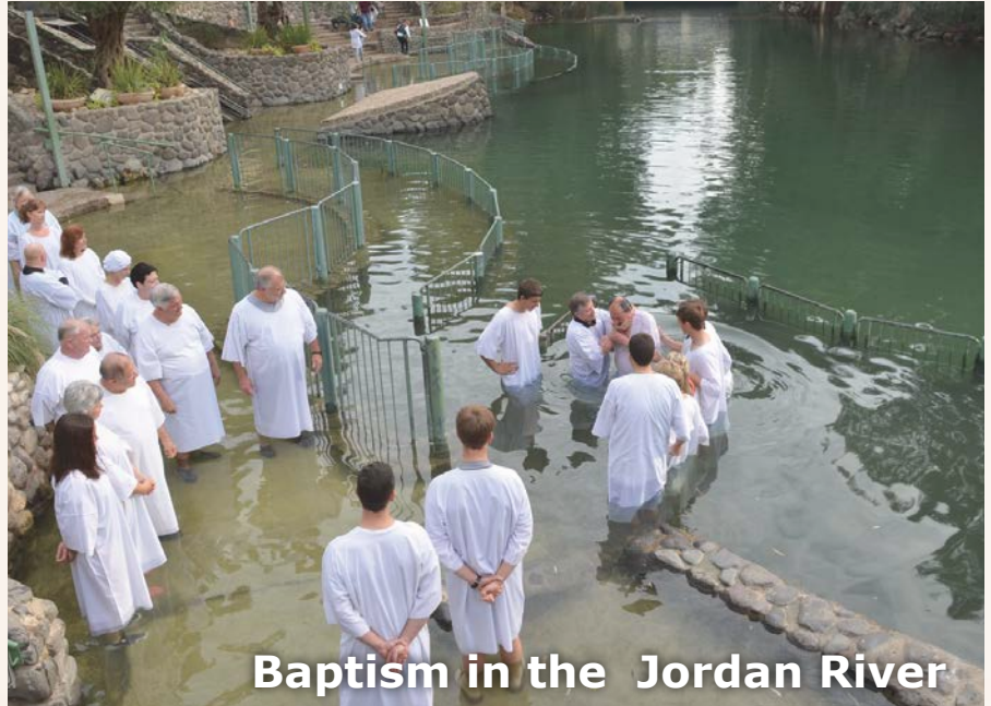
Baptism in the Jordan River

After breakfast we take a boat ride across the Sea of Galilee. While on the boat we'll pause for a brief worship service and remember the many miracles our Lord