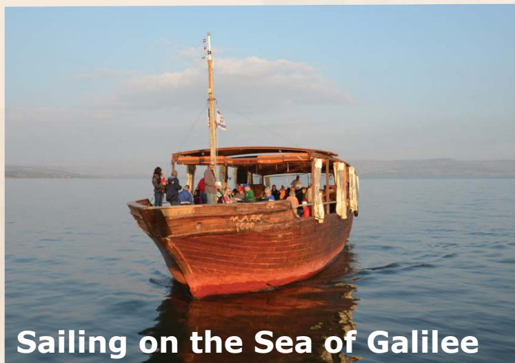
Sailing on the Sea of Galilee

After breakfast, we will travel up the coast to Caesarea by the sea. There we will visit the Crusaders' castle, the Roman amphitheater, the seaport from which the Apostle Paul sailed to Rome, and the Roman aqueduct system. We continue along the coast to Mount Carmel to see the site of Elijah's triumph over the prophets of Baal. After lunch we continue north to Megiddo on the Plain of Armageddon to see King Solomon's stables and water supply system. Prophecy will come alive at Megiddo as we look over the Valley of Armageddon. We then travel to Nazareth, the boyhood home of Jesus, to visit the oldest of the churches of the annunciation and Mary's well. On our way to Tiberias we will stop in the little town of Cana where Christ turned the water into wine. We will hold a short ceremony in an ancient church for the couples who wish to renew their marriage vows. Then we'll proceed to our hotel in Tiberias on the Sea of Galilee for dinner and overnight. (B/L/D)