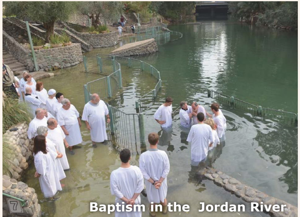
Baptism in the Jordan River

After breakfast we take a boat ride across the Sea of Galilee. While on the boat we'll pause for a brief