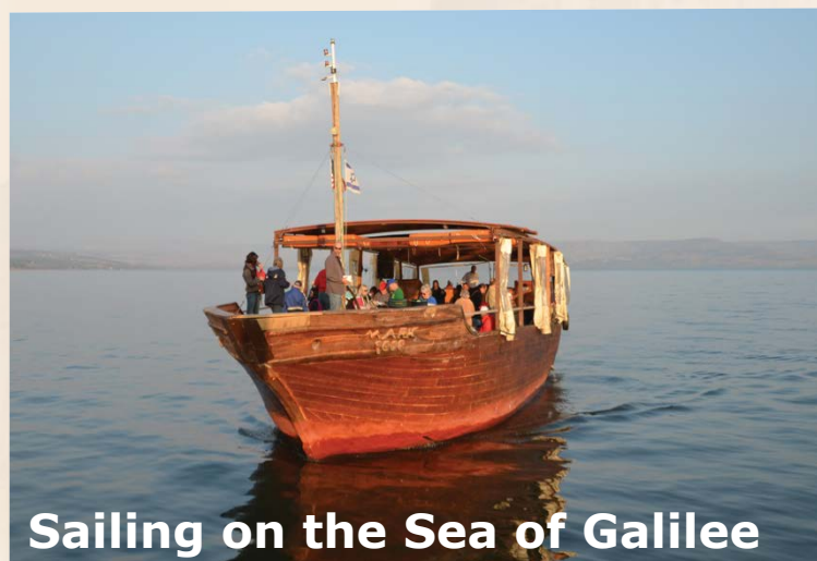
Sailing on the Sea of Galilee

After breakfast at our hotel we will meet our local guide and driver and begin our tour of the Holy Land. We start with a visit to Joppa, Jonah's port of embarkation for Tarshish. Joppa was also the home of Tabitha (or Dorcas) who was raised from the dead by Peter. It was also here that Peter learned that God was interested in the salvation of the Gentiles. After our tour of Joppa, we will travel up the coast to Caesarea by the Sea. There we will visit the Crusaders' castle, the Roman theater, the seaport from which the Apostle Paul sailed to Rome, and the Roman aqueduct system. We will continue along the coast to Mount Carmel to see the site of Elijah's triumph over the prophets of Baal. After lunch we continue north to Megiddo on the Plain of Armageddon to see King Solomon's stables and water supply system. Prophecy will come alive at Megiddo as we look over the Valley of Armageddon, site of the final world war! We then travel to Nazareth, the boyhood home of Jesus, to visit the oldest of the churches of the annunciation. On our way to Tiberias we will stop in the little town of Cana where Christ turned the water into wine. We will hold a short ceremony in an ancient church for the couples who wish to renew their marriage vows. Then we'll proceed to our hotel in Tiberias on the Sea of Galilee for dinner and overnight. (B/L/D)