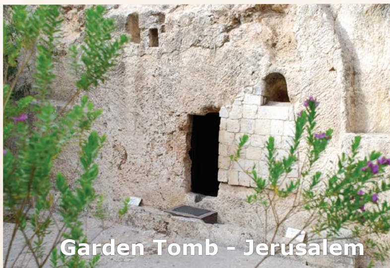
Garden Tomb - Jerusalem

Today our memorable journey and Holy Land pilgrimage comes to an end. We will transfer to the airport in Tel Aviv and board the plane for our return flight home. In flight we can fellowship with our friends and remember the many things we shared together.