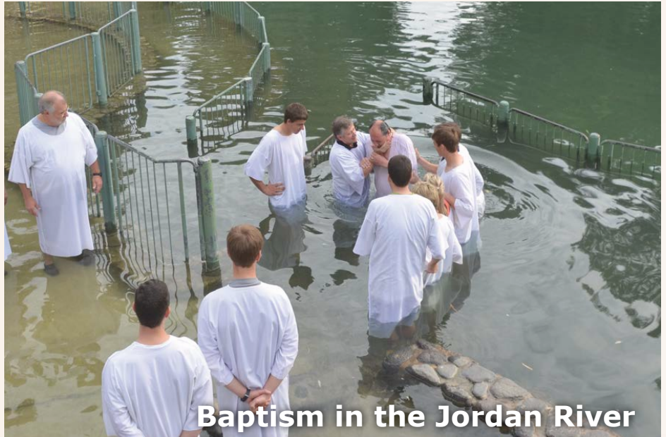
Baptism in the Jordan River

After breakfast we take a boat ride across the Sea of Galilee. While on the boat we'll pause for a brief worship service and remember the many miracles our Lord performed in this area. We'll dock at Nof Ginossar to visit the "Jesus