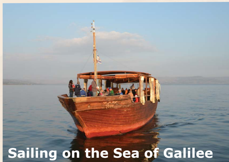
Sailing on the Sea of Galilee

After breakfast at our hotel we will meet our local guide and driver and begin our tour of the Holy Land. We start with a visit to Joppa, Jonah's port of embarkation for Tarshish. Joppa was also the home of Tabitha (or Dorcas) who was raised from the dead by Peter. It was also here that Peter learned that God was interested in the salvation of the Gentiles. After our tour of Joppa, we will travel up the coast to Caesarea by the Sea. There we will visit the Crusaders' castle, the Roman theater, the seaport from which the Apostle Paul sailed to Rome, and the Roman aqueduct system. We will continue along the coast to Mount Carmel to see the site of Elijah's triumph over the prophets of Baal. After lunch we continue north to Megiddo on the Plain of Armageddon to see King Solomon's stables and water supply system. Prophecy will come alive at Megiddo as we look over the Valley of Armageddon, site of the final world war! We then travel to Nazareth, the boyhood home of Jesus, to visit the oldest of the churches of the annunciation. On our way to Tiberias we will stop in the little town of Cana where Christ turned the water into wine. We will hold a short ceremony in an ancient church for the couples who wish to renew their marriage vows. Then we'll proceed to our hotel in Tiberias on the Sea of Galilee for dinner and overnight. (B/L/D)