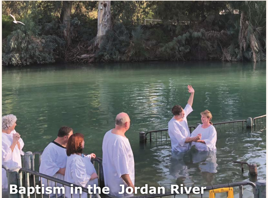
Baptism in the Jordan River

service and remember the many miracles our Lord performed in this area. We'll dock at Nof Ginossar to visit the "Jesus Boat" museum to see a boat that dates back to the time of Jesus. We will then stop at the Primacy of Peter, where Jesus commanded Peter to "Feed my sheep." Then we'll proceed to Capernaum to see the remains of an early church, the ruins of Peter's house, and the ancient synagogue. After a special lunch of St. Peter's Fish, we'll travel to the Mount of Beatitudes above the Sea of Galilee to read the Sermon on the Mount while overlooking the