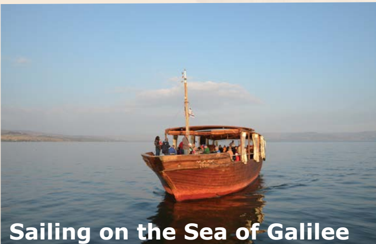
Sailing on the Sea of Galilee

After breakfast we take a boat ride across the Sea of Galilee. While on the boat, we'll pause for a brief worship