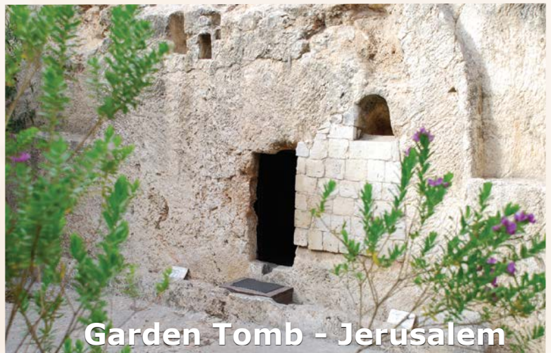
Garden Tomb - Jerusalem