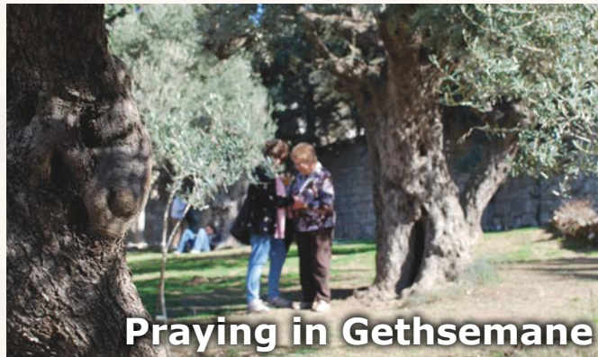
Praying in Gethsemane

Our second day in Jerusalem begins with a visit to the famous Western Wall and Tunnel excavation site. We will visit Ecce Homo (Behold the Man), site of the Antonia Fortress. We'll pass many of the traditional 14 Stations of the Cross on the Via Dolorosa and also see part of the old colorful oriental market. We will continue our walk and visit the restored Jewish