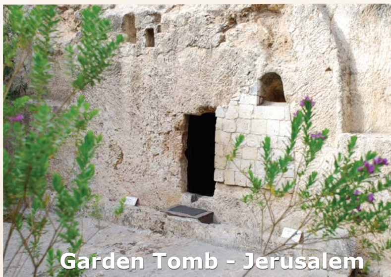
Garden Tomb - Jerusalem

Today our memorable journey and Holy Land pilgrimage comes to an end. We will transfer to the airport in Tel Aviv and board the plane for our return flight home. In flight we can fellowship with our friends and remember the many things we shared together.