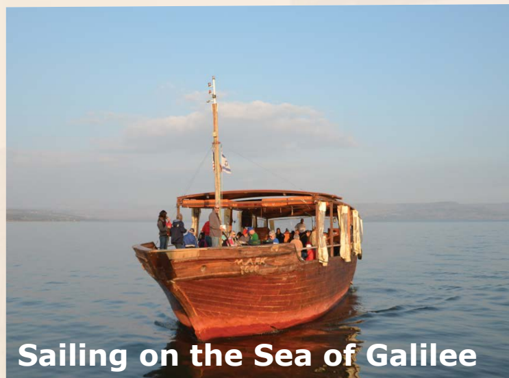
Sailing on the Sea of Galilee

After breakfast, we will travel up the coast to Caesarea by the sea. There we will visit the Crusaders' castle, the Roman amphitheater, the seaport from which the Apostle Paul sailed to Rome, and the Roman aqueduct system. We continue along the coast to Mount Carmel to see the site of Elijah's triumph over the prophets of Baal. After lunch we continue north to Megiddo on the Plain of Armageddon to see King Solomon's stables and water supply system. Prophecy will come alive at Megiddo as we look over the Valley of Armageddon. We then travel to Nazareth, the boyhood home of Jesus, to visit the oldest of the churches of the annunciation and Mary's well. On our way to Tiberias we will stop in the little town of Cana where Christ turned the water into wine. We will hold a short ceremony in an ancient church for the couples who wish to renew their marriage vows. Then we'll proceed to our hotel in Tiberias on the Sea of Galilee for dinner and overnight. (B/L/D)