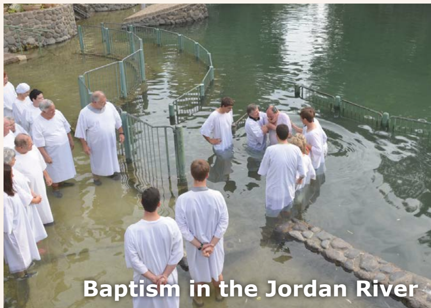
Baptism in the Jordan River

After breakfast we take a boat ride across the Sea of Galilee. While on the boat we'll pause for a brief worship service and remember the many miracles our Lord performed in this area. We'll dock at Nof Ginossar