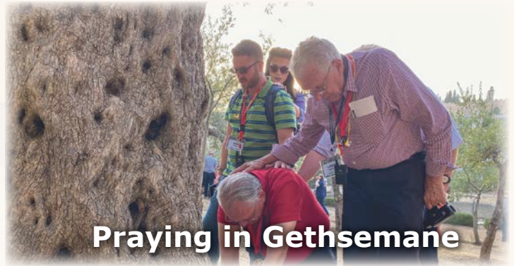
Praying in Gethsemane

This morning, we will travel to the Mount of Olives for a breathtaking panoramic view of Jerusalem's Old City. As we look across the valley, we'll take time to reflect on the many significant events in Jesus' ministry that took place in this area. Next, we will visit the Southern Steps, the main entrance for pilgrims ascending to the Temple in Jesus' time. Here, we'll walk on the original stones and pause for a meaningful time of worship and reflection where Jesus taught the Scriptures. After lunch, we'll head to Mount Zion to visit the traditional location of the Upper Room, where Jesus shared the Last Supper with His disciples and where the Holy Spirit came upon them at Pentecost. We will then visit the Temple Institute, where we'll view restored temple articles and learn about the preparations being made for a future temple in Jerusalem, gaining unique insight into Jewish faith and expectation. Finally we will end our day with a visit to the Western Wall. (B/L/D)