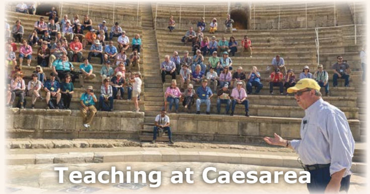
Teaching at Caesarea

of the city where the Philistines hung the bodies of Saul and Jonathan. Then we will visit Bethabara where John baptized those who came to him (John 1:28). This is also known as the "place of crossing" where the children of Israel crossed into the Promised Land (Joshua 3:14-17). We will travel through the Jordan Valley to Jericho, one of the oldest cities in the world. If conditions permit, we will enter Jericho to see the excavations of the ancient walls, view the Mount of Temptation, and see Elisha's Spring. After lunch we will travel to the nearby mountain fortress of Masada, truly a remarkable piece of history. We'll ascend by cable car to visit the magnificent ruins of the fortress where the Jewish