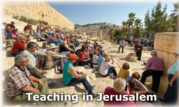
Teaching in Jerusalem

This morning, if conditions permit, we will begin our day by ascending the Temple Mount, the historic site where the Jewish Temple once stood before its destruction in 70 A.D. As we walk across this sacred space, we'll reflect on its central role in biblical history and prophecy. Then we'll visit the beautiful Crusader Church dedicated to St. Anne and the nearby Pool of Bethesda. We will then travel to Shiloh, which was the spiritual center of Israel for centuries, where the Tabernacle first rested in the land. Here Hannah prayed, Samuel heard God's call, and Israel gathered before the Lord. Dinner and overnight will be at our hotel in Jerusalem. (B/L/D)