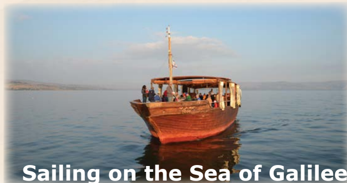
Sailing on the Sea of Galilee

This morning we will leave the Galilee area travel south through the Jordan River Valley. We stop and visit the new excavations at Beit She'an. Here we will see the excavations