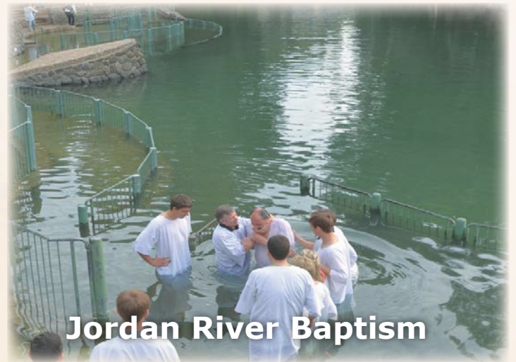
Jordan River Baptism

of the city where the Philistines hung the bodies of Saul and Jonathan. Then we will visit Bethabara where John baptized those who came to him (John 1:28). This is also known as the "place of crossing" where the children of Israel crossed into the Promised Land (Joshua 3:14-17). We will travel through the Jordan Valley to Jericho, one of the oldest cities in the world. If conditions permit, we will enter Jericho to see the excavations of the ancient walls, view the Mount of Temptation, and see Elisha's Spring. After lunch we will travel to the nearby mountain fortress of Masada, truly a remarkable piece of history. We'll ascend by cable car to visit the magnificent ruins of the fortress where the Jewish