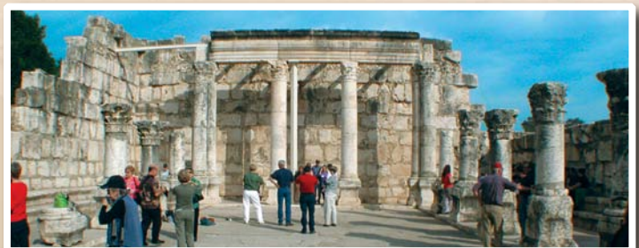
Remains of a Synagogue in Capernaum

After breakfast we take a boat ride across the Sea of Galilee. While on the boat we'll pause for a brief worship service and remember the many miracles our Lord performed in this area. We'll dock at Nof Ginossar to visit the "Jesus Boat" museum to see a boat that dates back to the time of Jesus. Then we will stop at the Primacy of Peter where Jesus commanded Peter to "Feed my sheep". Then we'll proceed to Capernaum to see the remains of an early church, the ruins of Peter's house, and the ancient synagogue. After lunch we'll travel through the Golan Heights, then descend to the site of Banias where springs form a source of the Jordan River. Near here Peter made his great confession that Jesus Christ is Lord (Matthew 16:16). From several vantage points today we can see Mount Herman in the distance. Then we'll gather on the Mount of Beatitudes by the Sea of Galilee to read the Sermon on the Mount while overlooking the Jordan Valley. On the return to our hotel in Tiberias we'll stop on the banks of the Jordan River for a baptismal service (B/L/D).