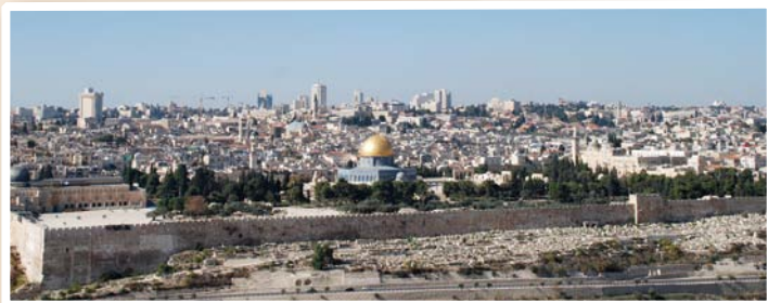
Holy City of Jerusalem

After breakfast we'll begin our journey to Jerusalem. We'll first stop in Cana where Christ turned the water into wine. We will hold a short ceremony in an ancient church for the couples who wish to renew their marriage vows. We then travel to Nazareth, the boyhood home of Jesus, to visit the oldest of the churches of the annunciation and Mary's well. Our journey continues to Megiddo on the Plain of Armageddon to see King Solomon's stables and water supply system. Prophecy will come alive at Megiddo as we look over the Valley of Armageddon, site of the final world war! After lunch we'll continue along the coast to Mount Carmel to see the site of Elijah's triumph over the prophets of Baal. We'll then visit Caesarea by the sea and see the Crusaders' castle, the Roman amphitheater, the seaport from which the Apostle Paul sailed to Rome, and the Roman aquaduct system. Then we'll drive to Jerusalem, capital of Israel for over 3000 years. Upon arrival in Jerusalem our guide will lead us in the traditional Jewish welcome, a custom which dates back to the time of Abraham. Dinner and overnight will be at our hotel in Jerusalem (B/L/D).