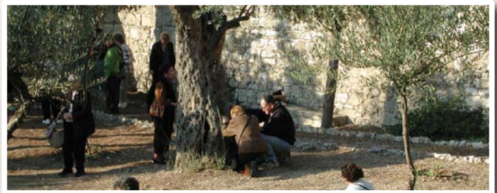
Praying in Gethsemane

Our third day in Jerusalem begins with a visit to the famous Western Wall and Tunnel Excavation site. Our next stop will be Antonio's Fortress, site of Pilate's Palace. We'll pass the traditional 14 Stations of the Cross on the Via Dolorosa and also see part of the old colorful oriental market. We will continue our walk and visit the restored Jewish Quarter and the Roman Cardo. The Cardo was the main street of Jerusalem in Roman times. Then we'll proceed to Mount Zion to visit the Upper Room, traditional site of the Last Supper and the fire of the Holy Spirit on Pentecost. We will also visit the traditional location of the Tomb of King David. After lunch we will visit the Shrine of the Book museum where some of the Dead Sea Scrolls are kept. We will also visit the Model City of Jerusalem. The Model City is a 1:50 scale model of Jerusalem as it was during Jesus' time on earth (B/L/D).