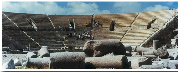
Ampitheater at Caesarea