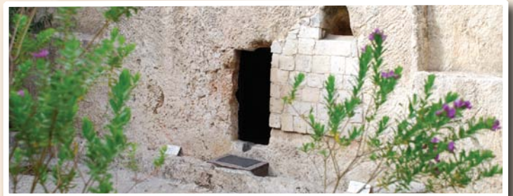
The Garden Tomb - Jerusalem

Today is our last day in the Holy Land so we want to make the most of it. We start our tour with a visit to the Garden of Gethsemane where Jesus had His agony and was betrayed. There we will pause for devotion and prayer time in a private garden. After our worship service we will take a short walk through the Valley of the Tombs. Along the way we will pass the traditional tombs of Absalom and Ezra. After our walk we will visit the recent archaeological discovery of the Pool of